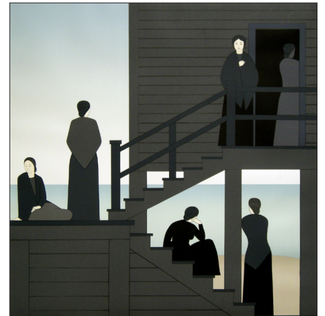
WILL BARNETT Waiting , 1975 Screenprint, 33 3/4 x 32 7/8"

Staff Selects is an exhibition of works from the Museum of Art's permanent collection which reflect the visual sensibilities and interests of the Museum's staff. The staff was asked to pick several pieces from the collection that they found to be particularly appealing or interesting, and that have not been recently exhibited. The result is a wonderfully eclectic assemblage of prints, paintings, and photographs that show the depth and richness of the UMMA collection.