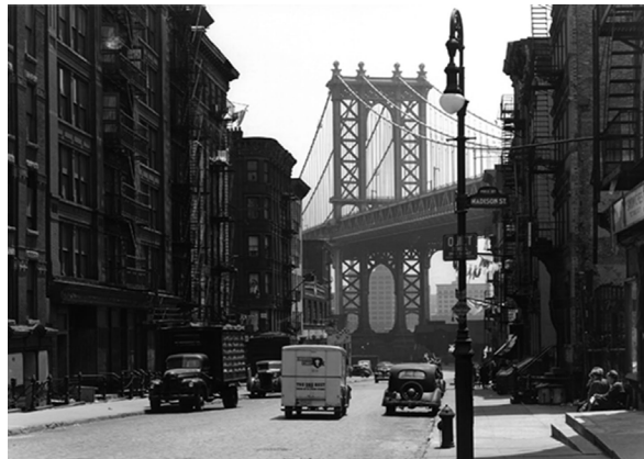
TODD WEBB Café on Champs Elysees, Paris, 1946 Gelatin silver print, 13 x 10"

Courtesy of Aucocisco Galleries and the Estate of Todd Webb/Evans Gallery of Fine Art Photographs